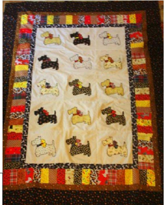
Quilt donated by Cheryl Schaeffer Size 50" x 68