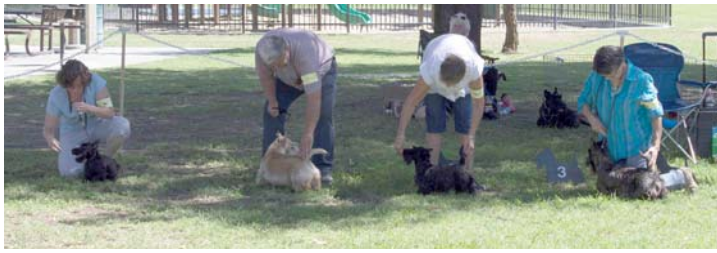
(Continued from page 1)

Even though it was a very hot day it was a great match.